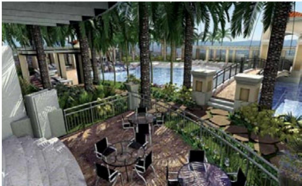
Commercial, residential and recreational activities at Bukit Baja.

The main objective for this Science Park is to develop a dedicated area to be able to facilitate reliable and solid science and technology based industries. Selangor Science Park 2 will hopefully encourage further