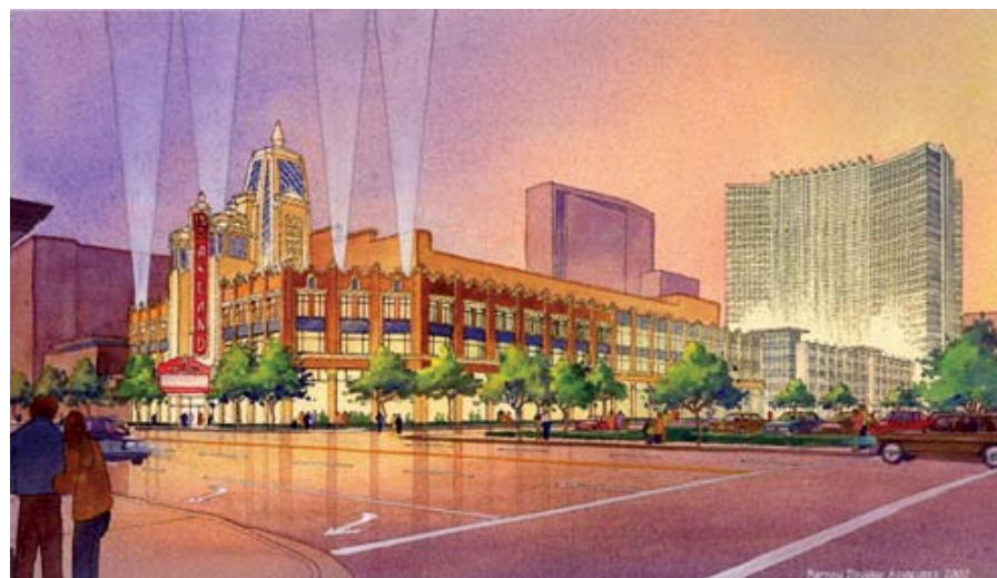
A modern city

The Selangor State Development Corporation (PKNS) acts as a catalyst of growth to the State of Selangor. This government agency has already developed many new growth areas into well sought after addresses in the property market.