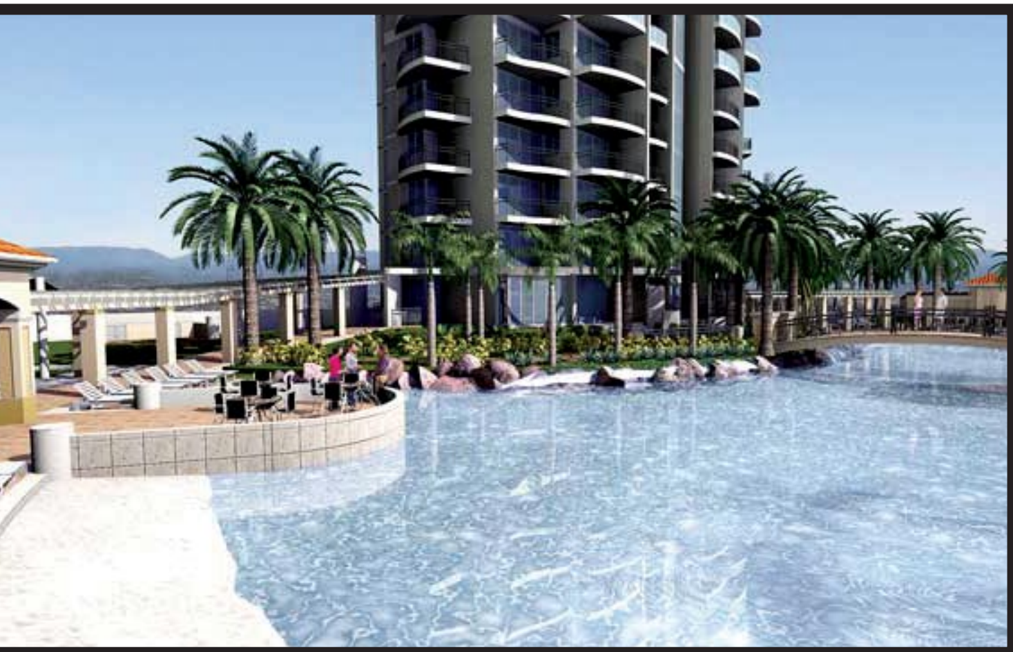
A modern style of living.

in this development, Selangor Science Park 2 will be the ideal base for all technological ventures.