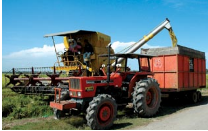
The agriculture sector in Selangor is fast growing.

Job opportunities from these investments in the past five years have grown by leaps and bounds with some 25,000 jobs created each year. The state is already planning for several industry clusters including Automotive logistics, steel, biotechnology, research and port related services, information technology and automation.