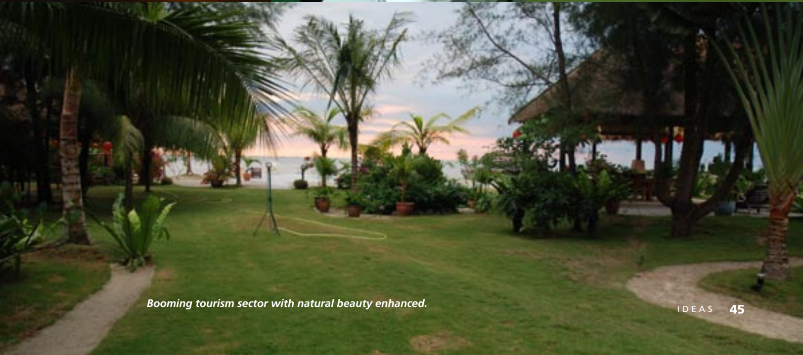
Booming tourism sector with natural beauty enhanced.