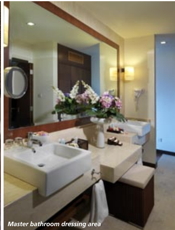
Master bathroom dressing area