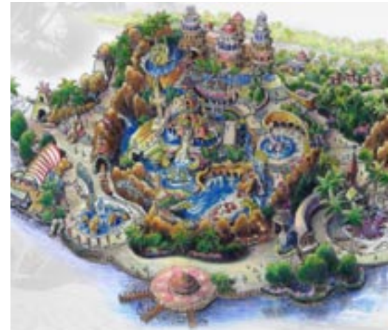
Hotel and Theme park

“While Sepang Goldcoast is envisaged to bring economic prosperity to the entire district of Sepang, it will not be at the expense of what is valued