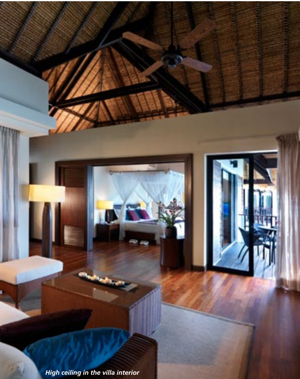
High ceiling in the villa interior