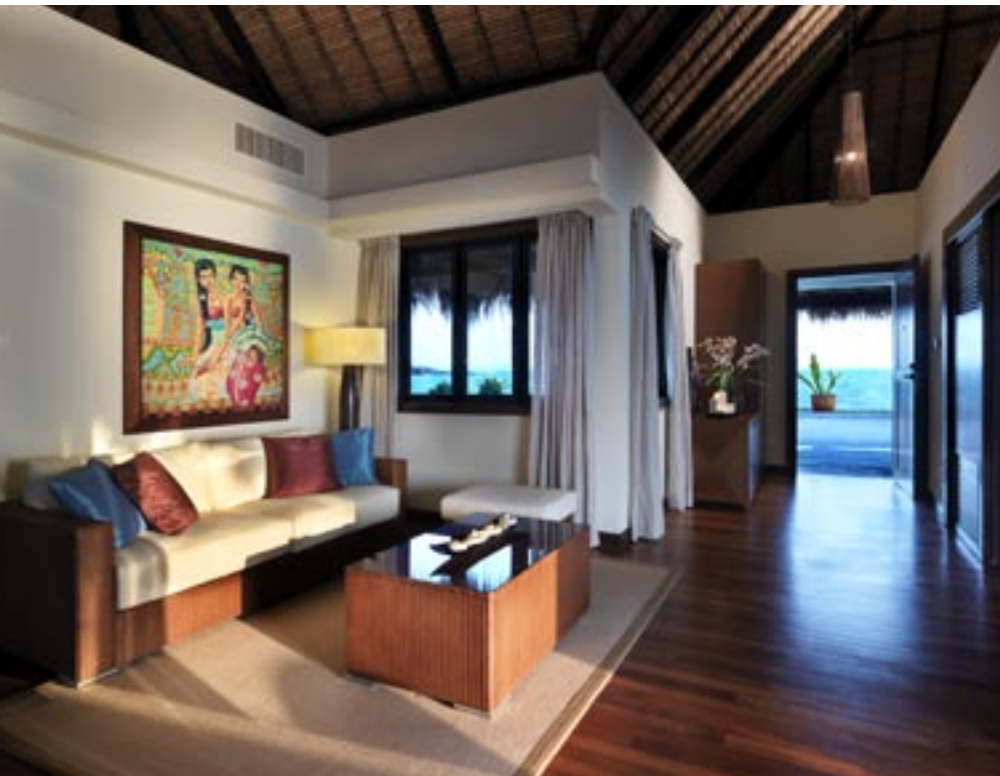
Entrance and lounge

sensitive to the environment. Large stretches of mangrove forest formed over time will be untouched by the development and become one of the main attractions for visitors.