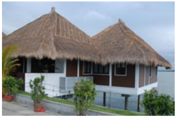
The palm-shaped water villas on the coast

Selangor Goldcoast is already rising here. This RM3billion project will be showcased in a resort style setting, very much in tune with the State Government's vision to boost tourism in Selangor.