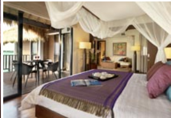
Master bedroom facing open deck

Selangor is more than a town synonymous with one of the world's most modern airports. It is a bastion of architecture, culture, tradition, fauna and flora, even a lifestyle that is becoming increasingly difficult to experience at one place.