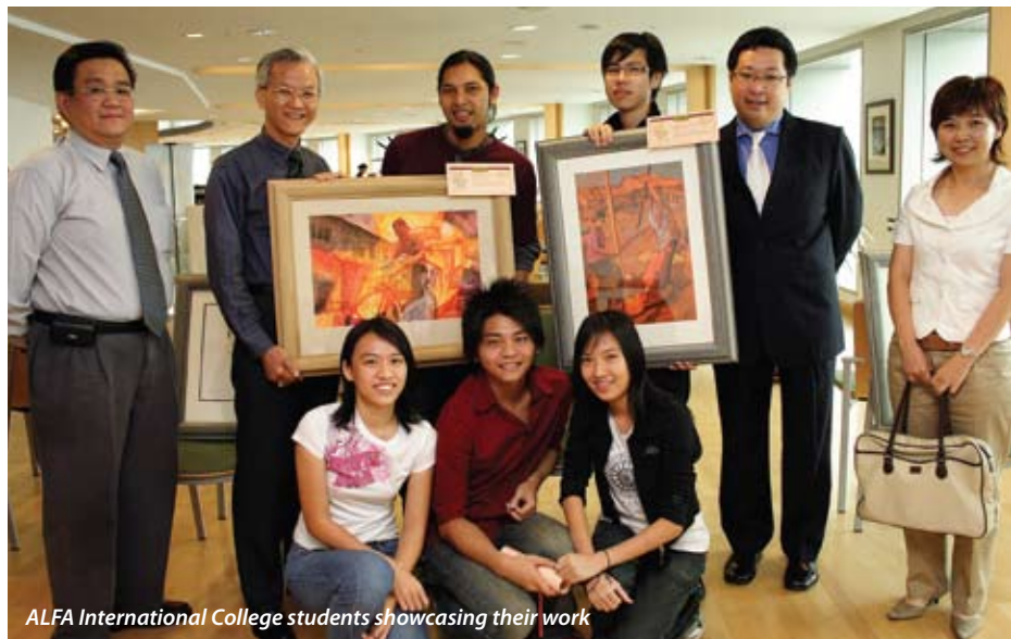
ALFA International College students showcasing their work

seeking quality education. This makes the programmes more affordable. It can be conducted in a location that is conducive as well as within the cultural environment that is more friendly to Asians. This is reflected in international universities setting up campus here like Monash University.