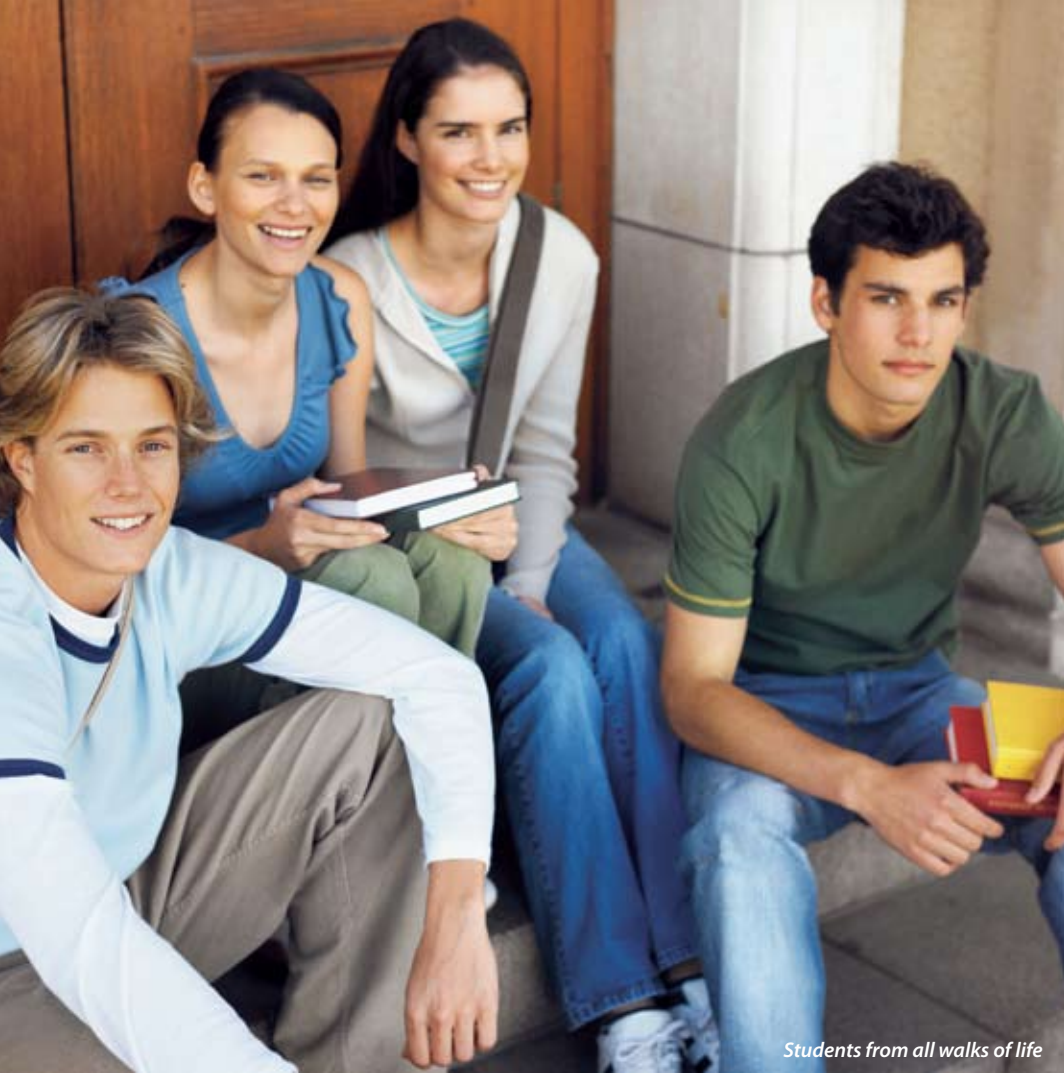
Students from all walks of life