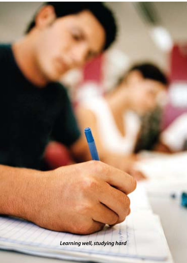
Learning well, studying hard

as the state aims to be the catalyst to the country's academic excellence. Selangor has so far based its academic plan as per the Education Ministry's blueprint which has accorded its smooth ascend. This is in accordance with the state government's aspiration to make education the prime-mover of human resources development. This in turn lures investors to Selangor, knowing fully well that a skilled and qualified workforce is growing within.