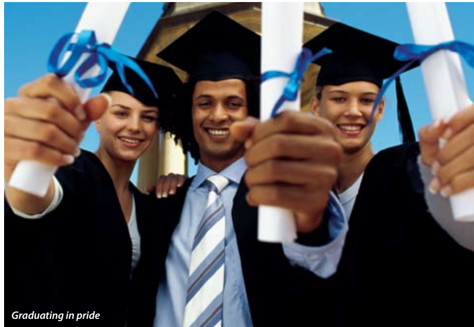
Graduating in pride

The strategy to make Selangor an international education hub is premised on the fact that it makes more sense for degree providers to bring their programmes to the doorstep of those