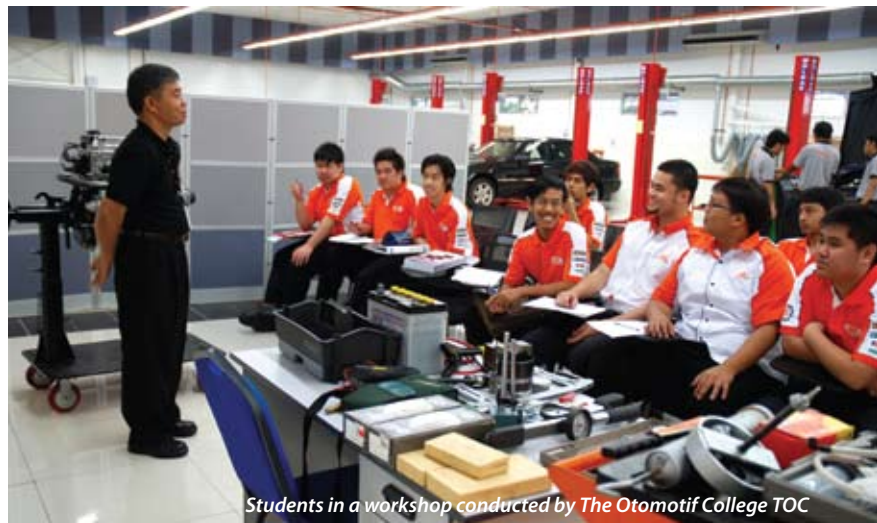
Students in a workshop conducted by The Otomotif College TOC

The state government has done their bid for the education sector investing in