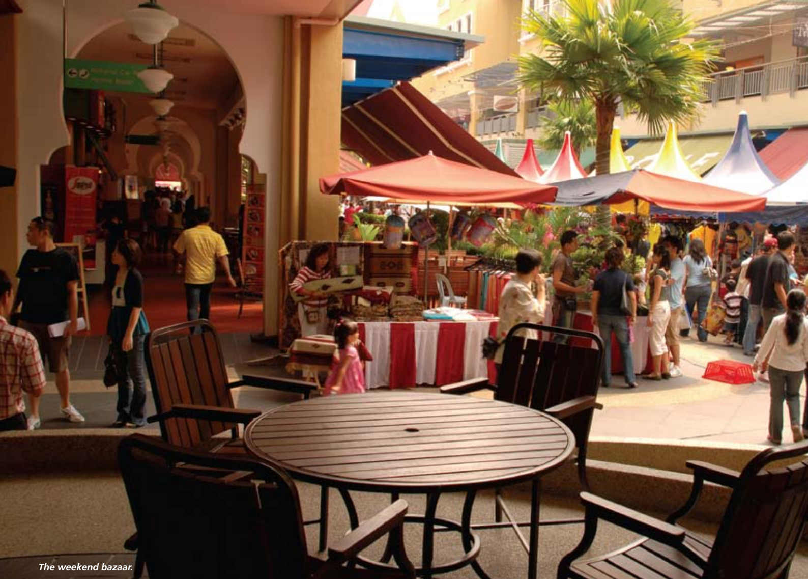
The weekend bazaar.