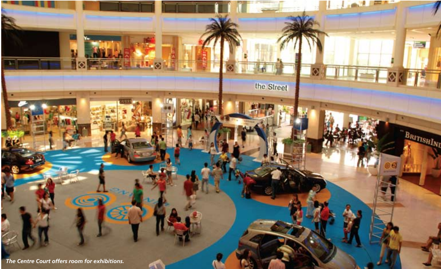
The Centre Court offers room for exhibitions.