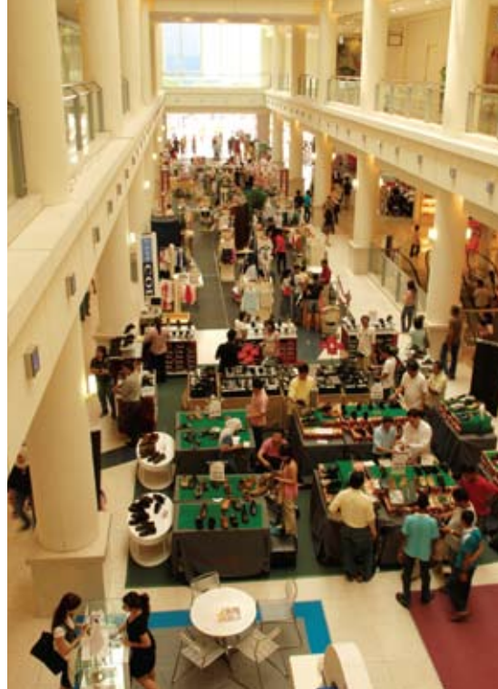
A sale going on at the mall's wing.

To enrich your shopping experience, you could also enjoy other services available at The Curve. From laser eye center, karaoke, mommy facilities, spas, beauty salons to gyms and even banks, The Curve is your one-stop shopping wonder!