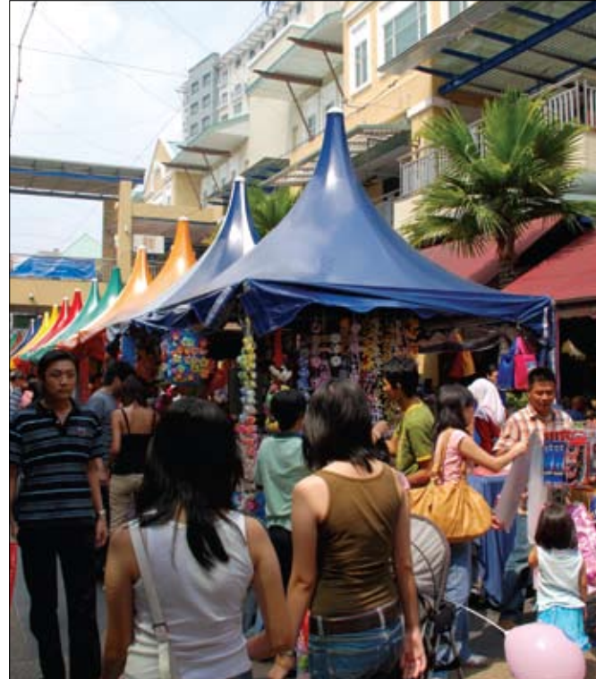
Little nick-nacks at the weekend flea market.