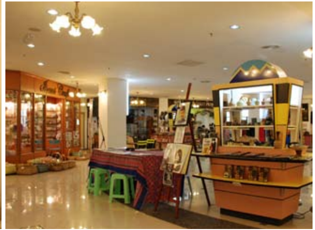
The many different shops and kiosks at this mall, displaying among others, local handicraft, interesting nick-nacks and paintings by local painters.