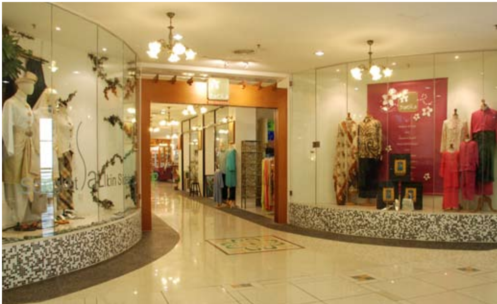
Traditional wear on display.