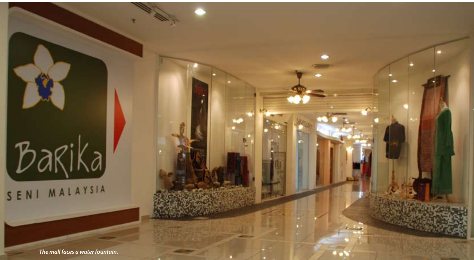
The mall faces a water fountain.

Arts, crafts, gifts and more are offered at this functional shopping haven.