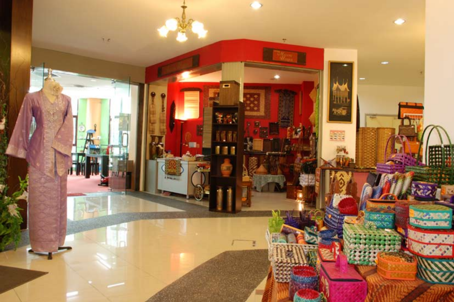
Handicraft, traditional baju kebaya and accesories on display.

and this platform offered a display of the collection available for all. Also featured as this event were GPS systems and fuel-saving items.