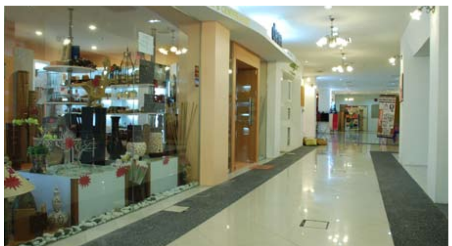
Find something for your home here.

Shah Alam City Centre (SACC Mall) Precinct 1.1 & Precinct 1.2, Jalan Perbadanan 14/9, Seksyen 14, 40000 Shah Alam, Selangor, Malaysia. Visit us at: www.sacc.com.my